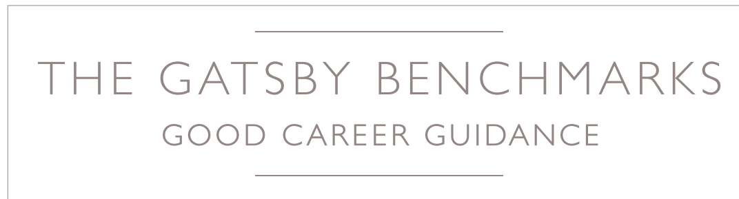
Negative logo (For use on dark backgrounds)